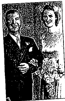
1949: wedding day.

met her husband at her brother's 21st birthday party. They married in 1949, and it was then she discovered he had been discharged from the army because of his nagging dysentery and diarrhoea.