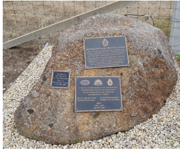
Commemorative Plaque 6 February 2021